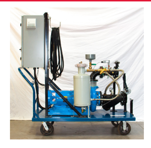
Leopard Rental Pump - Pump Side