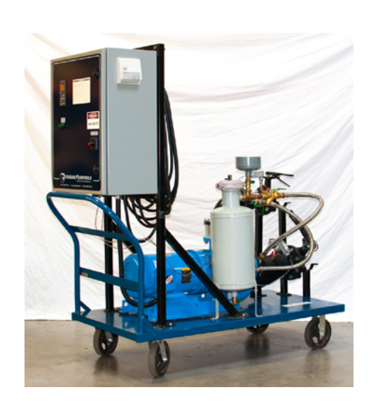
Leopard Rental Pump - Iso View