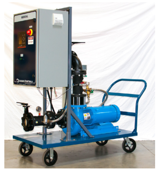
Bengal Rental Pump - Iso View